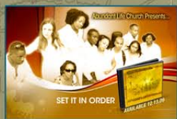
Abundant Life Church friday worship team