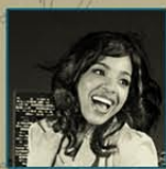
Chantel friday & saturday featured music